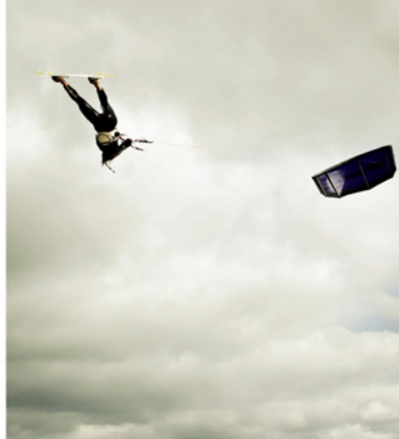
CAPTION → My first cover shot for a kitesurfing magazine with Bas Kooke doing a kite loop into a late back roll, really for the typically cold Dutch look, which really adds to the action.

At the Dutch Kiteboard Championship last year it was cold, raining and I was stood there in a long rain jacket. When a fly first hot storm hit, that was the first time that I thought, what am I doing here?